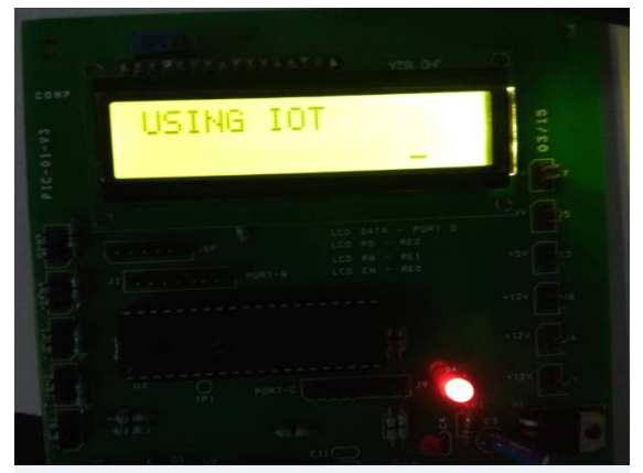
Fig 1.2-Using IOT