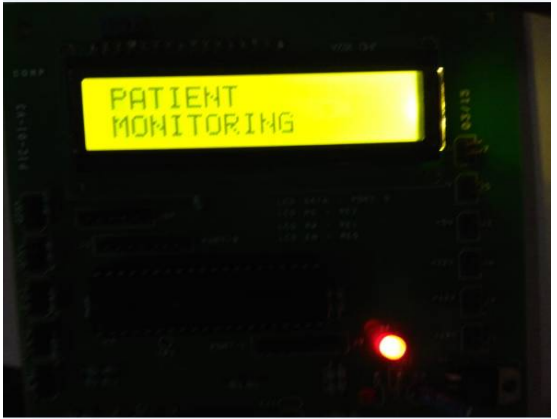
Fig 1.1-Patient Monitoring