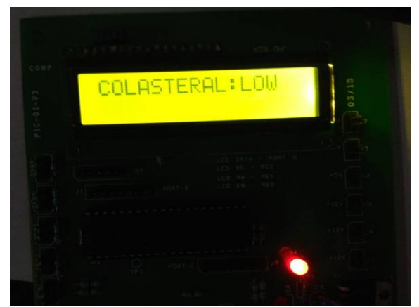
Fig 1.3-Cholesterol level monitoring